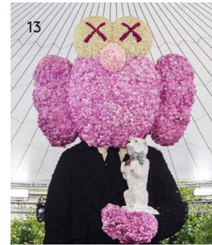
13 Peony art at the Paris fashion week