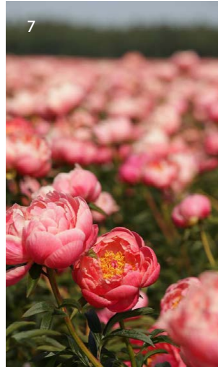
7 Living Coral: the hottest colour of the year