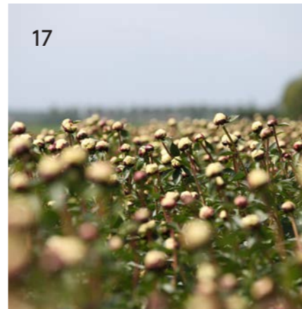
17 Co Knol is the personal peony trainer