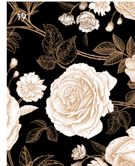
19 Epic and extravagant: the storied past of peonies