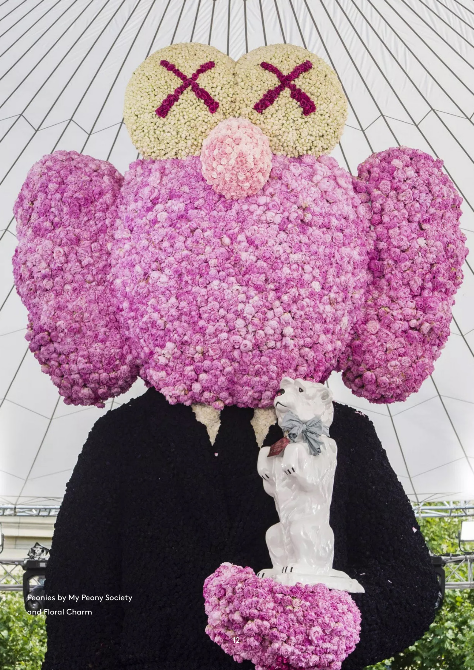
Peonies by My Peony Society and Floral Charm