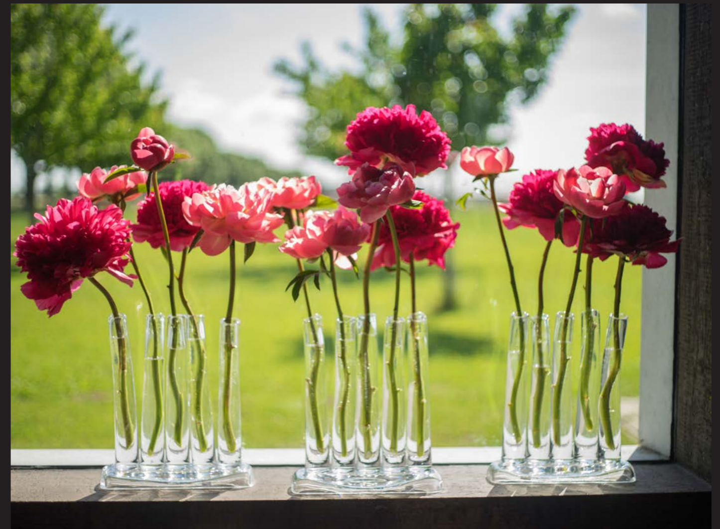
Each flower is a tiny miracle